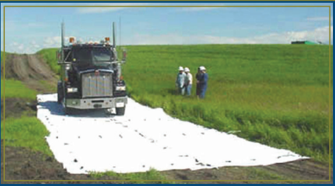
Crossing Sensitive Areas