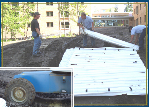
Poor Site Conditions