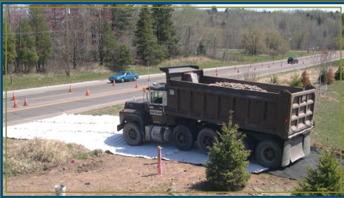
Alternative to Rock Entrance