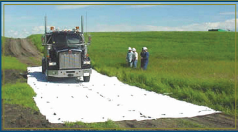
Crossing Sensitive Areas