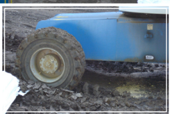
Poor Site Conditions